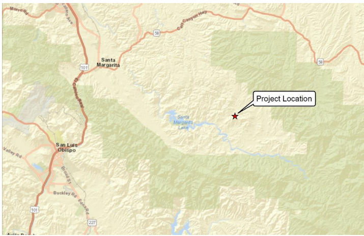
East Pozo Cannabis Grow (A neighbor is protesting)

Oceano Cannabis Dispensary Permit Modification